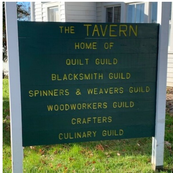
Tavern Welcome Sign