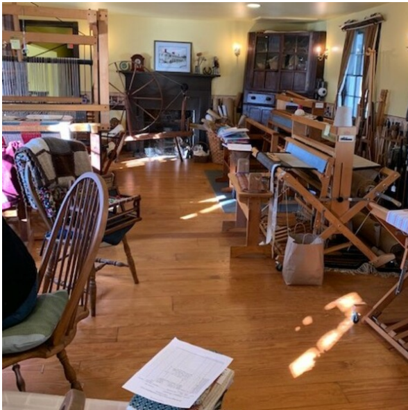
TSWG Studio (upstairs)