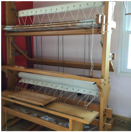
Fireside Tapestry Loom for sale