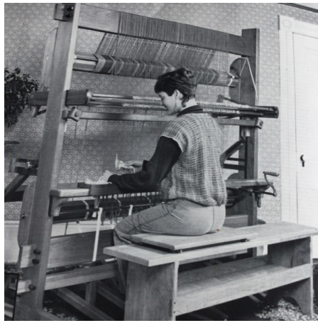
If interested or for additional information