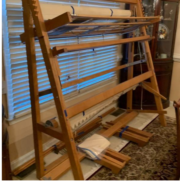
Barbara Ritter's Leclerc Tapestry loom (60 inches wide) is still looking for a new home.