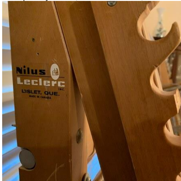
This lovely loom, kept in pristine condition, comes with an 8-dent reed and a cherry raddle.