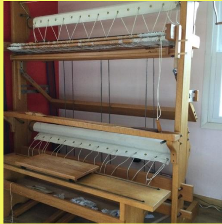
Fireside Tapestry Loom for sale