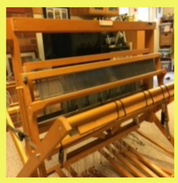
This loom will fold for storage!

This was Jerry Barnes's loom - I have woven double weave wool blankets, linen and cotton towels and much more. Very good, sturdy loom. The ten treadles are handy for tying up multiple patterns on the same warp.